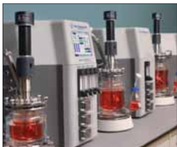
The BioFlo/CelliGen ® 115, a versatile, entry-level fermentor and bioreactor system from New Brunswick Scientific