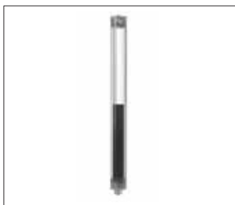
The MabDirect MM Fixed-D disposable chromatographic column from Upfront Chromatography

functional formulations with low endotoxin levels. The new line of formulations from Leinco is therefore ideal for both in vivo and in vitro experiments.