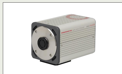
Hamamatsu Photonics ORCA-Flash2.8 digital camera

Hamamatsu Photonics has introduced the ORCA-Flash2.8 , its first high-sensitivity digital camera based on a next-generation Scientific CMOS image sensor and the ORCA-D2, a dual CCD camera which enables simultaneous dual-wavelength imaging and features two CCD devices with interchangeable optical blocks. The ORCA-Flash2.8 is designed for low-light imaging at high frame rates and combines high resolution, high sensitivity, high speed and low noise. The ORCA-Flash2.8