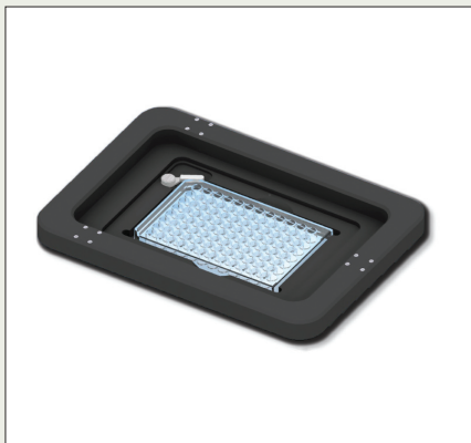
Ludl Electronic Products Piezo focus Z stage with plate holder

require the reworking of existing protocols. Mirrorball combines high sensitivity with high performance, low-loss optics. Mirrorball is also the first laser scanning microplate cytometer to offer simultaneous laser scanning. This will enable superior multiplexing resulting in higher throughput single pass scanning. The instrument is available in three upgradeable configurations; the highest specification will offer dual laser excitation (488 nm and 640 nm), four fluorescence data channels and a single laser scatter channel. Mirrorball's laser scatter channel enables label-free object recognition independent of fluorescence, which can be combined with concurrent collection of fluorescence data for even greater sensitivity in multiplexed assays.